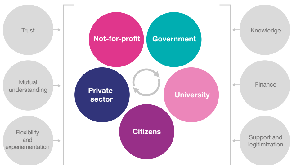
Figure 1: The penta-helix of urban stakeholders

In addition, it is engaging with the public by making use of the MyGov platform. This is important as greenfield city development plans must create inclusive destinations to innovate, work, live and play for all parts of society.