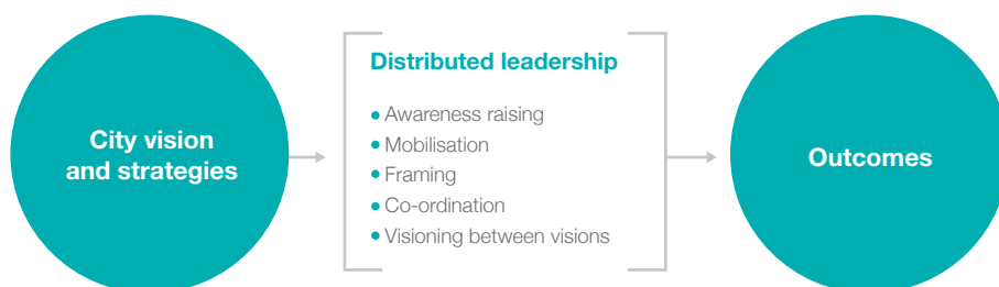
Figure 3: Mediating visions and outcomes: key processes of distributed leadership

In addition to raising awareness, a key role for urban leaders is to selectively activate and enrol actors in a place with relevant resources for urban development, such as knowledge, time, finance and energy. This means doing something different from trying to enforce visions and top-down city plans. This in turn requires strong sensitivity and the ability to understand the values, goals and strategies of different players . Stockholm’s eco-district provides a good illustration of the need to mobilise relationships across stakeholders ranging from utilities to real estate and knowledge institutes.