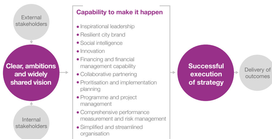
Figure 2: From vision to outcome – leadership is a core capability

Managing in these spaces often requires collaboration between the public and private sectors and between actors with rather different motivations and value creation models and goals. Moreover, there are often no specific mandates to intervene in those areas.